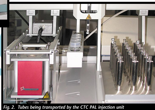
Fig. 2. Tubes being transported by the CTC PAL injection unit

Now the sample tube can undergo a conditioning step in the TDAS oven heater. Otherwise the sample tube will be transported back to the sample tray. By selecting appropriate TDAS parameters (e.g., desorption temperature, desorption time) it is also possible to control the number of extracted compounds as well as the molecular weight distribution.